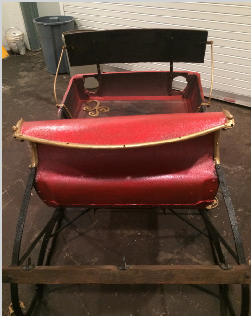
This sleigh will be decorated and put in our Old Time Christmas exhibit during the Holidays 2016.