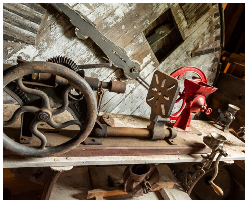
EASTON ROLLER MILL