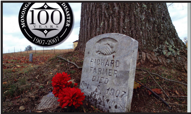
Monongah Coal Mine Disaster, 100 Years, 1907-2007, a Pictorial History