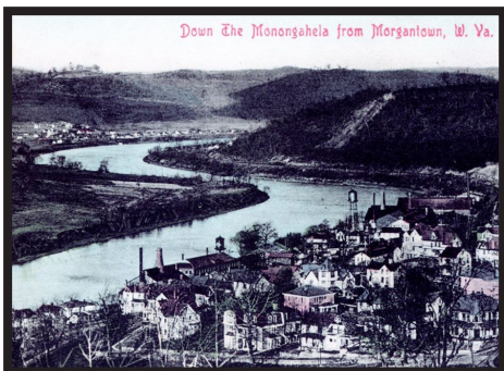
City of Morgantown in 1918