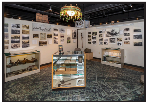
Our Exhibit Room